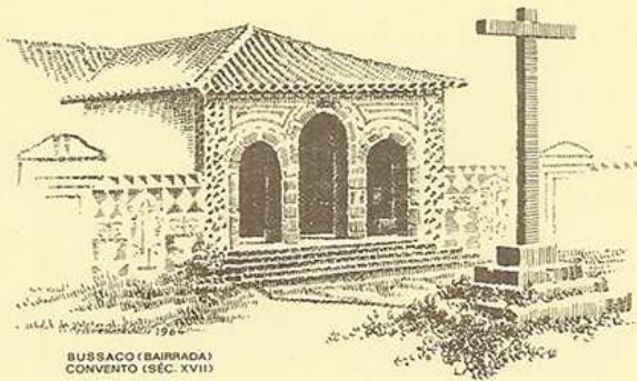
BUSSACO (BAIRRADA) CONVENTO (SÉC. XVII)