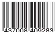
Image Type: Back

Actual Dimensions: 4 inches W X 3.12 inches H