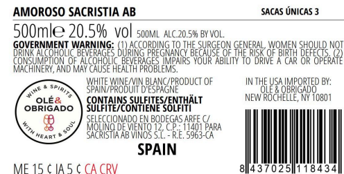
Image Type: Brand (front) or keg collar Actual Dimensions: 4.14 inches W X 2.25 inches H