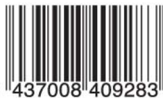
Image Type: Back

Actual Dimensions: 4 inches W X 3.12 inches H